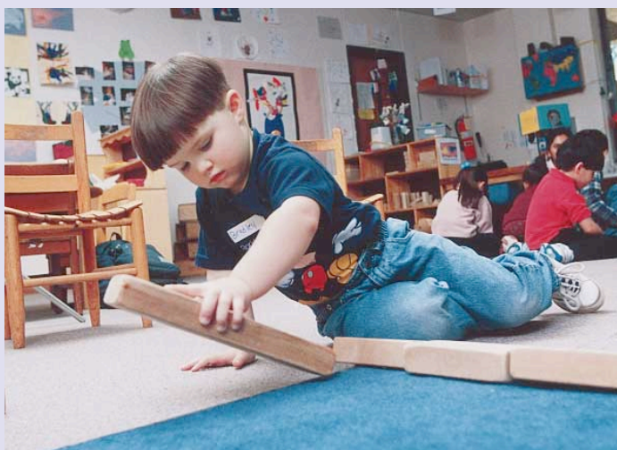
Measuring the perimeter of a rug